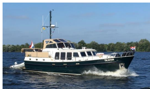
'Talisman', Linden spiegelkotter 14.50, built in 2006 at Linden Jachtbouw in Hardinxveld-Giessendam