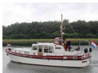
'Elbarco', Gillissen Steenvlet 12.45, built in 1990 at De Scheepsbouwers Maritien in Werkendam