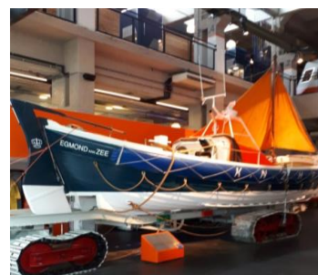
Photos of the Gillissen event in Den Helder